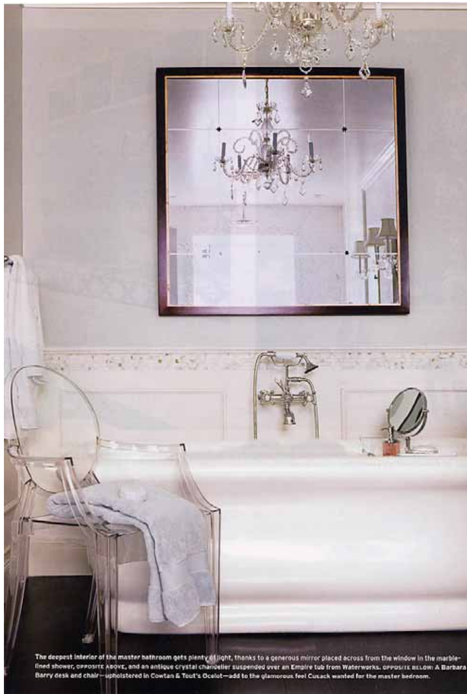
The deepest interior of the master bathroom gets plenty of light, thanks to a generous mirror placed across from the window in the marble-lined shower, OPPOSITE ABOVE , and an antique crystal chandelier suspended over an Empire tub from Waterworks. OPPOSITE BELOW : A Barbara Barry desk and chair—upholstered in Cowtan & Tout's Ocalot—add to the glamorous feel Cusack wanted for the master bedroom.